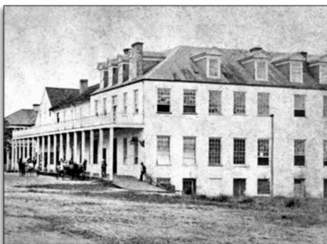
City Hotel (1870-1874)